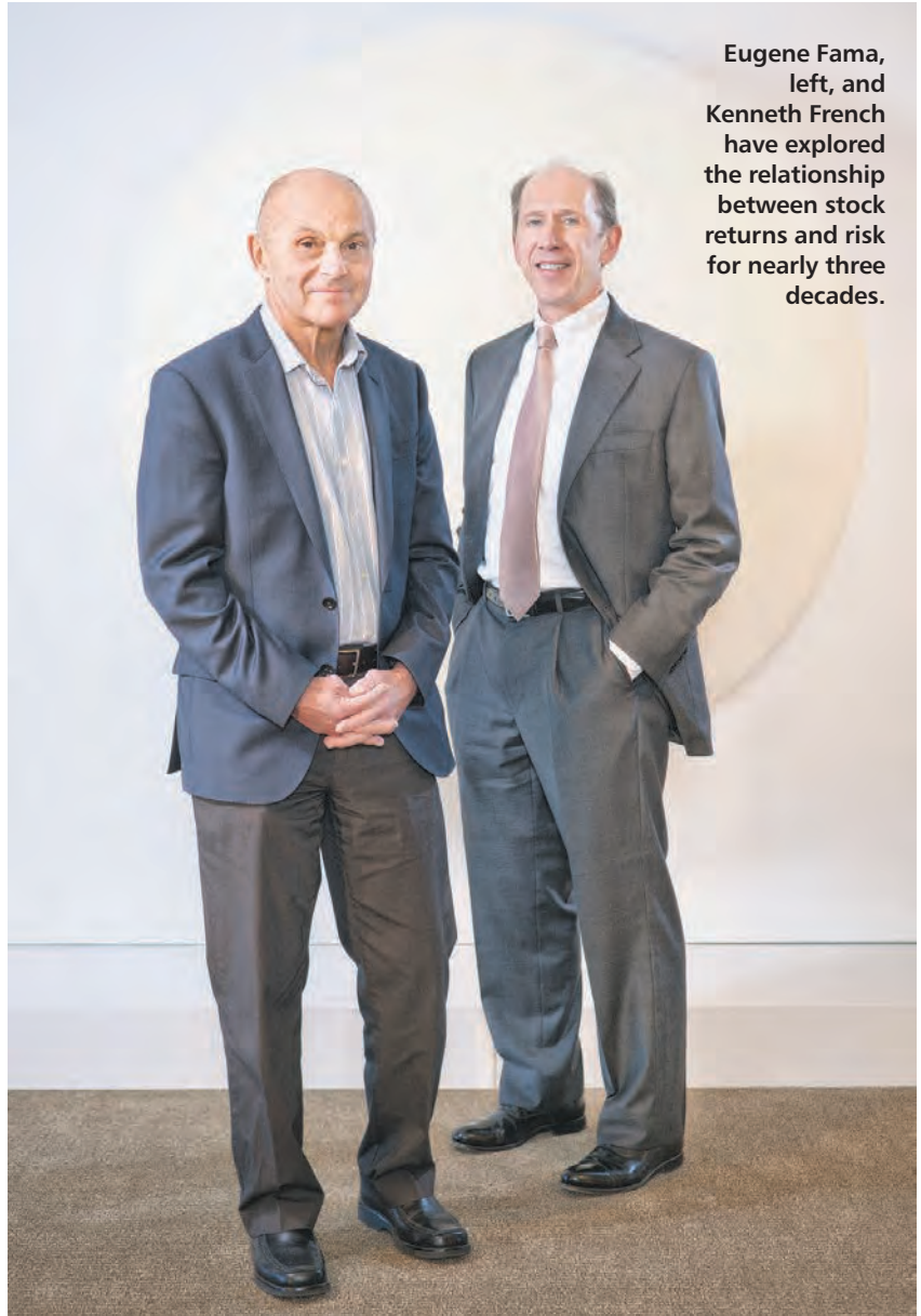
Eugene Fama, left, and Kenneth French have explored the relationship between stock returns and risk for nearly three decades.

The basics of market efficiency are often misunderstood. Some say that if factors such as a stock's value, size, trading momentum, and profitability—all of which are part of your multifactor model—indicate outperformance, then the market isn't really efficient.